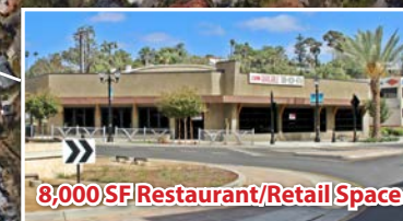
306 S. SANTA FE AVE