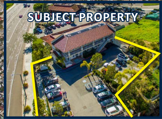
NORTH SANTA FE APARTMENTS