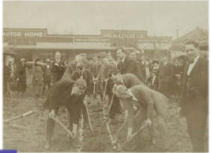
Ground breaking ceremony – Early 1920's