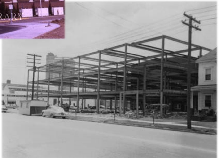
Education Building under construction – 1960's