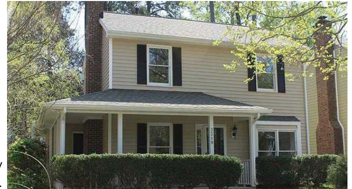
Sample single-family homes on Lassiter St.