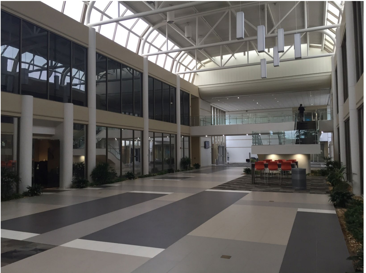
Newly Renovated Atrium