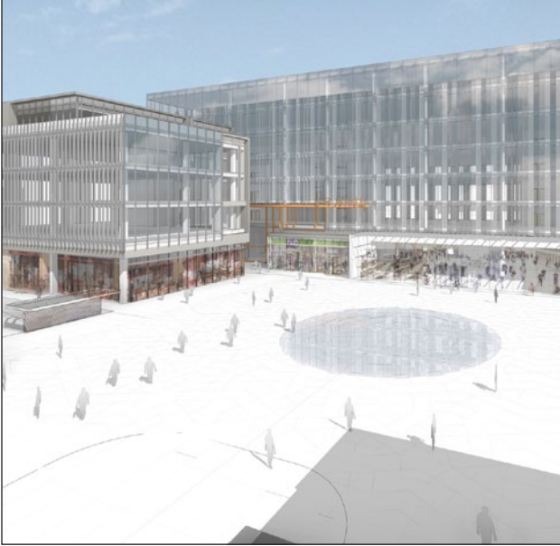
LOT 9 ± 220,000 SF