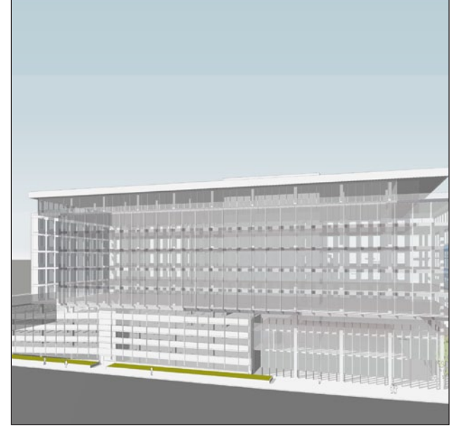
LOT 17 ± 235,000 SF