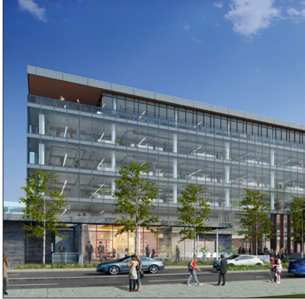
LOT 11 ± 225,000 SF