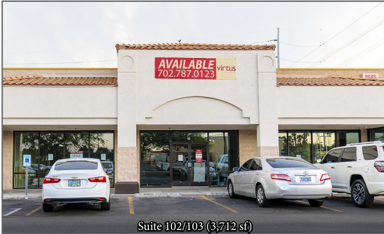
Suite 102/103 (3,712 sf)