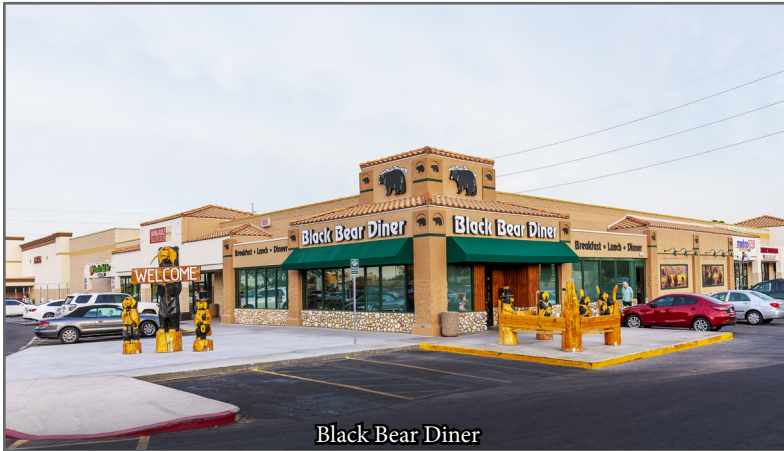
Black Bear Diner

RETAIL SPACES • 8555-8597 W SAHARA AVE, LAS VEGAS, NV - 89117