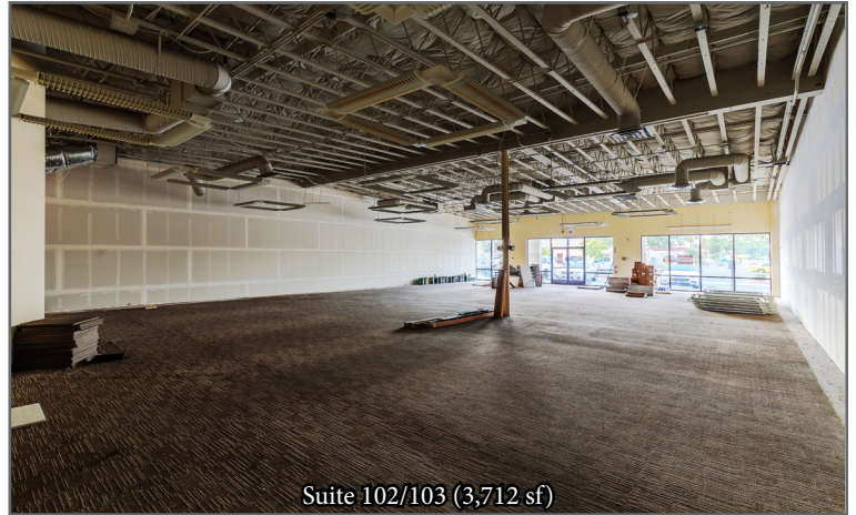
Suite 102/103 (3,712 sf)