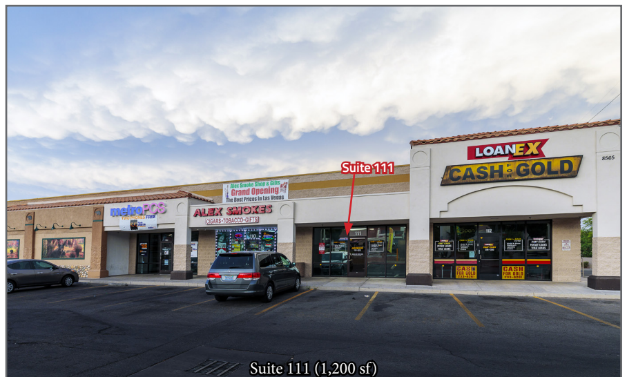
Suite 111 (1,200 sf)