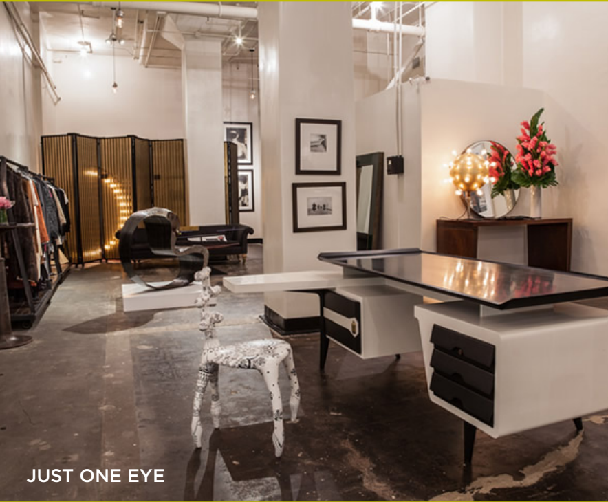
JUST ONE EYE