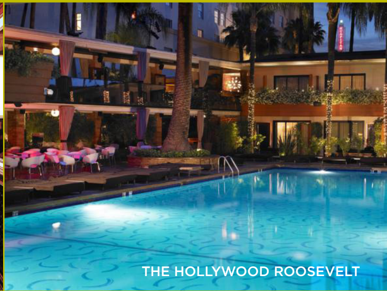
THE HOLLYWOOD ROOSEVELT