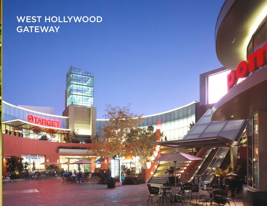
WEST HOLLYWOOD GATEWAY