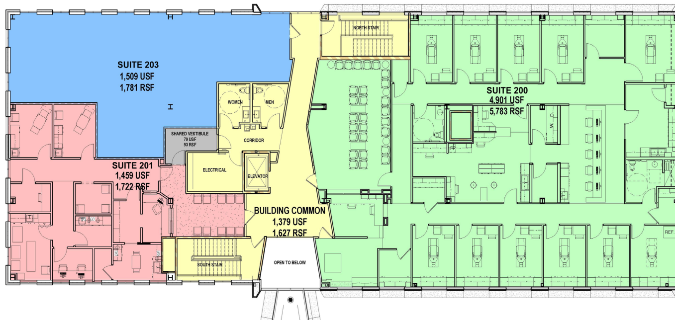
1 SECOND FLOOR PLAN