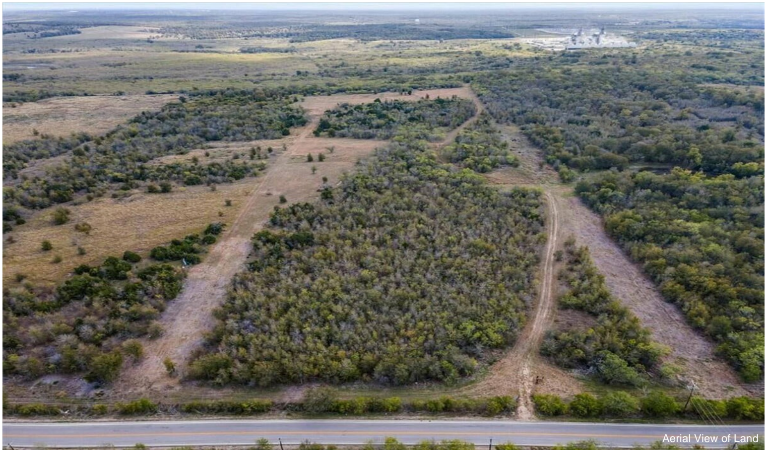
Aerial View of Land