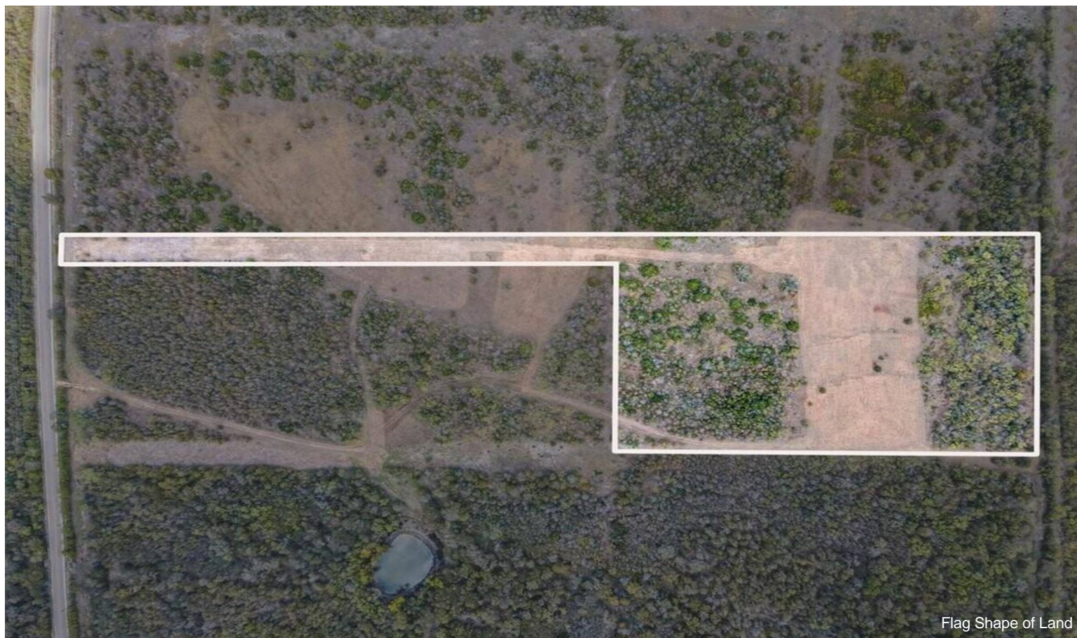
Flag Shape of Land