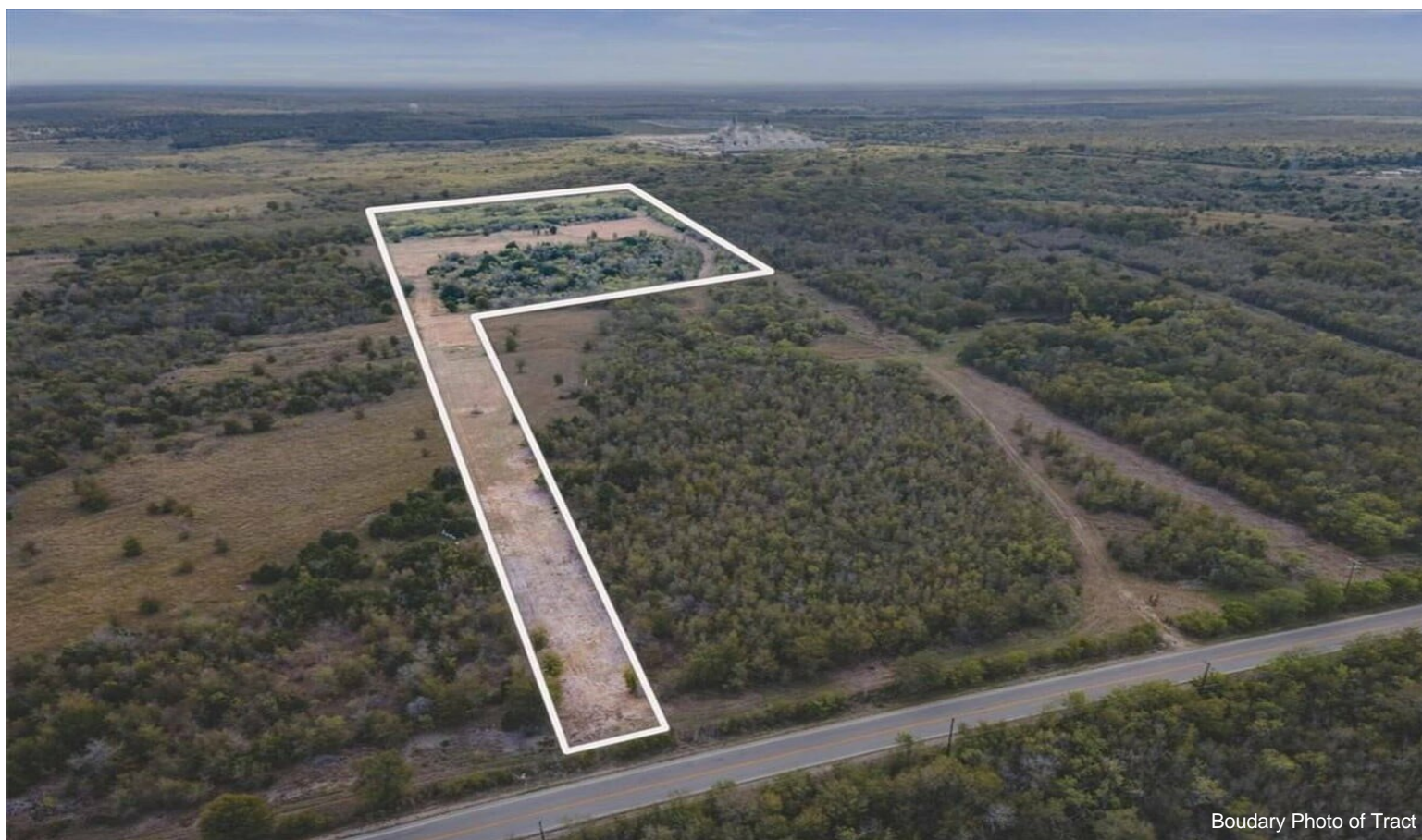
Boundary Photo of Tract