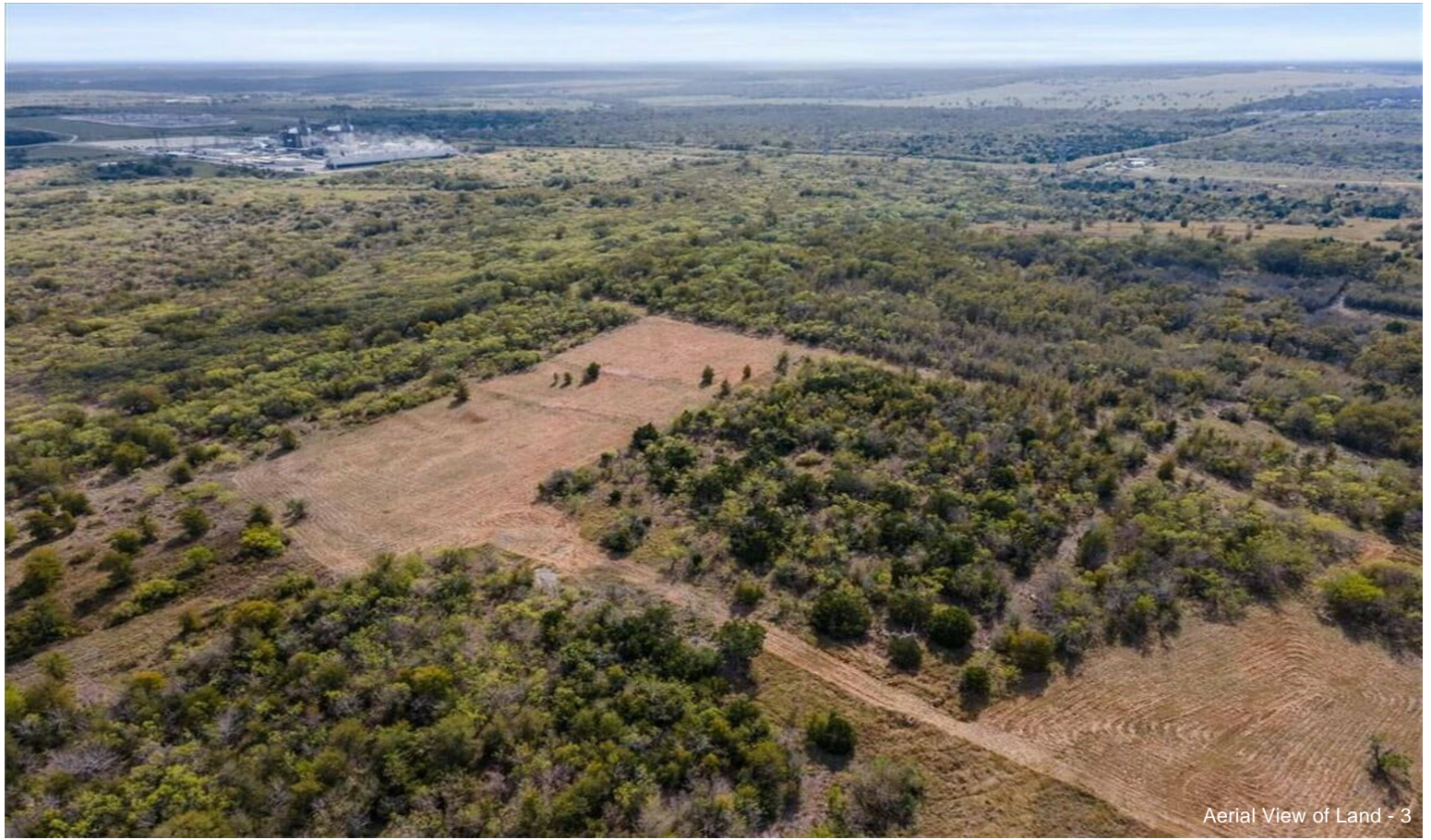
Aerial View of Land - 3