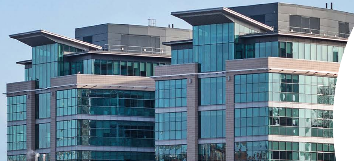
BALTIC PLACE EAST