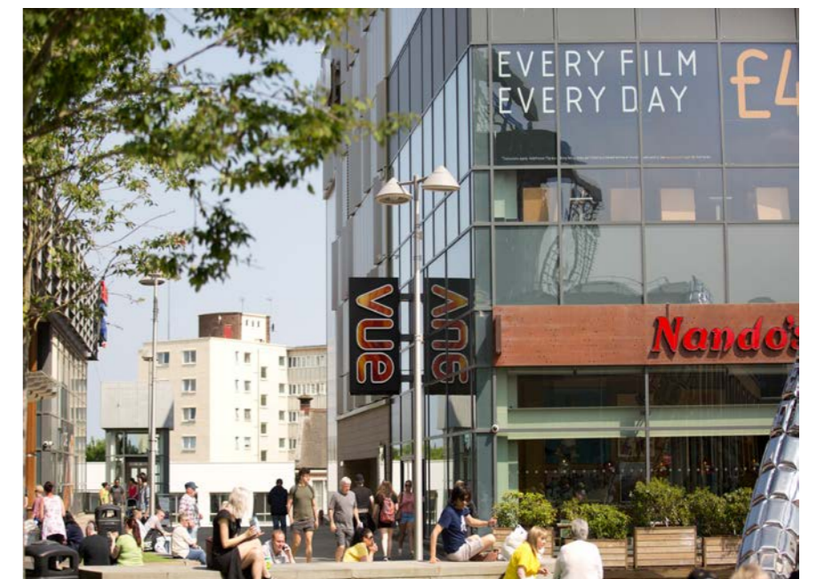
Gateshead Town Centre

Pedestrian access to Newcastle Quayside is enabled via the Millennium Bridge, broadening the amenity to occupiers at Baltic Place.