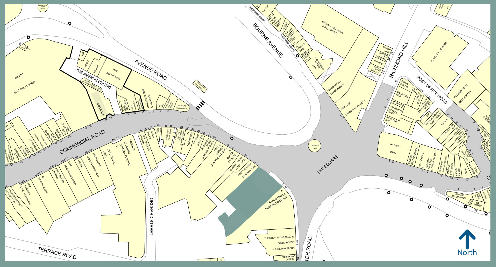
#repurposing #placemaking #community #social impact #town centre curation #work live socialise #communities are the new anchor