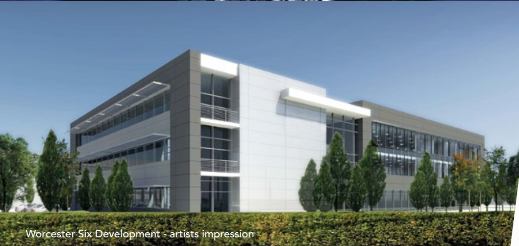
Worcester Six Development - artists impression