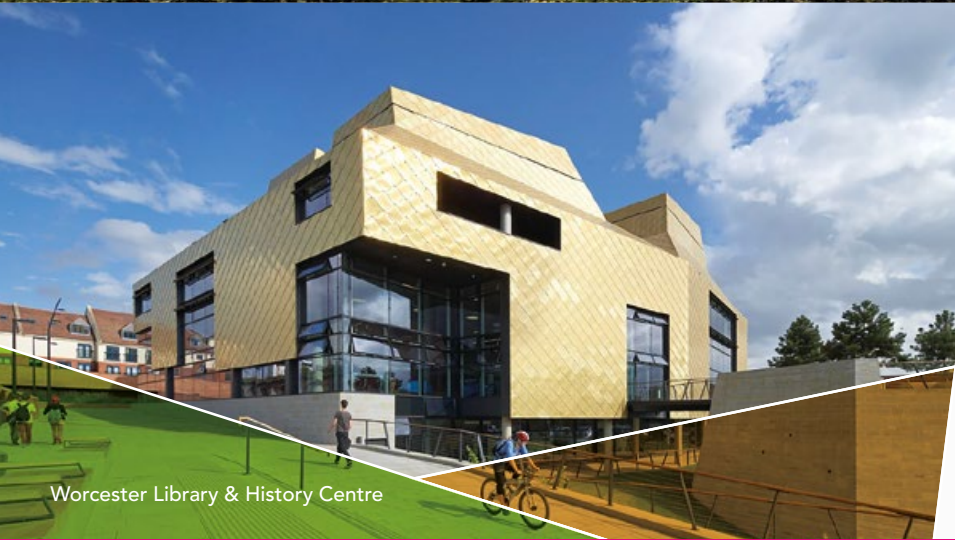
Worcester Library & History Centre

INDUSTRIAL / TECHNOLOGY / OFFICE / WAREHOUSING / MANUFACTURING