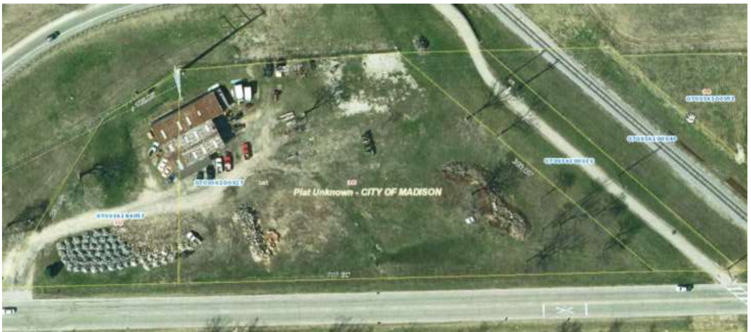
Aerial of site, showing approximate boundaries and existing site improvements: 65 year old metal building with slab on grade foundation, gravel drive and parking lot.