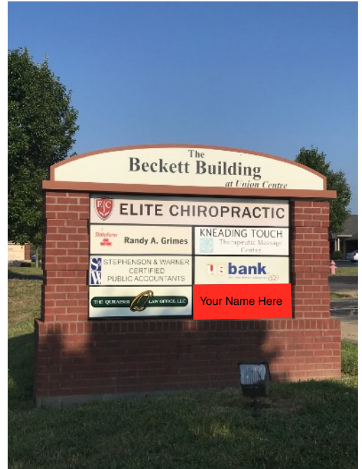
Click for Photos