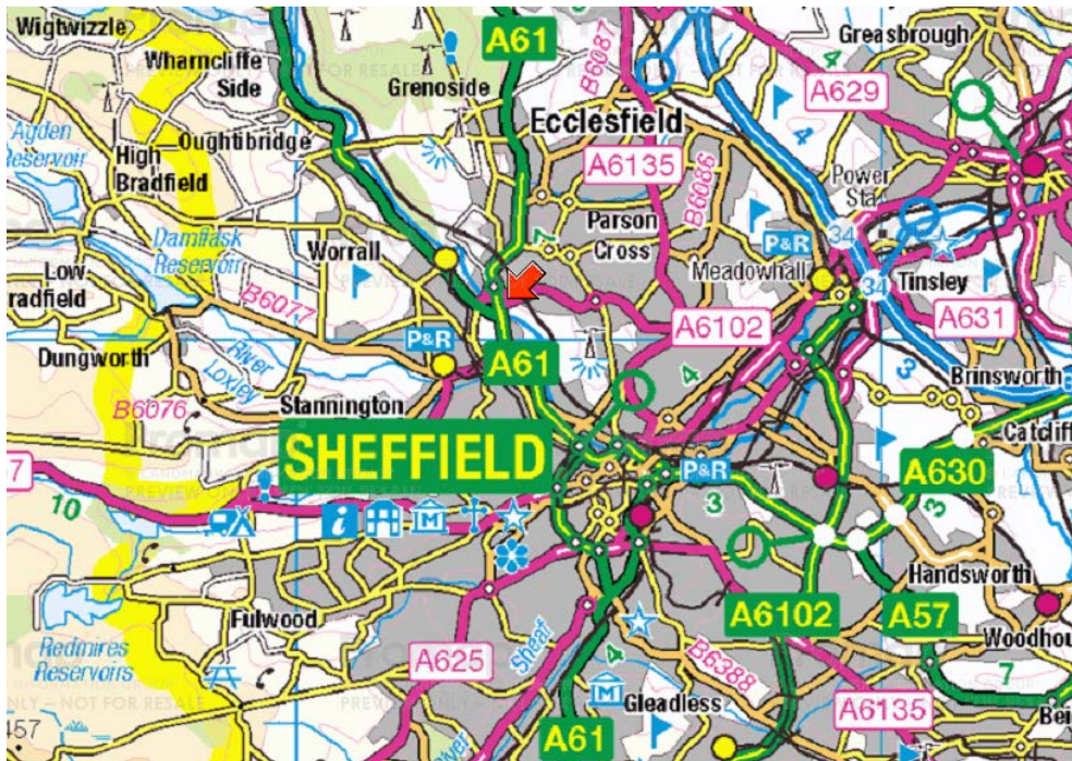
Location Plan, Promap

54% of residents within a 20 min drive of Penistone Road are ranked as ABC1 (above National average).