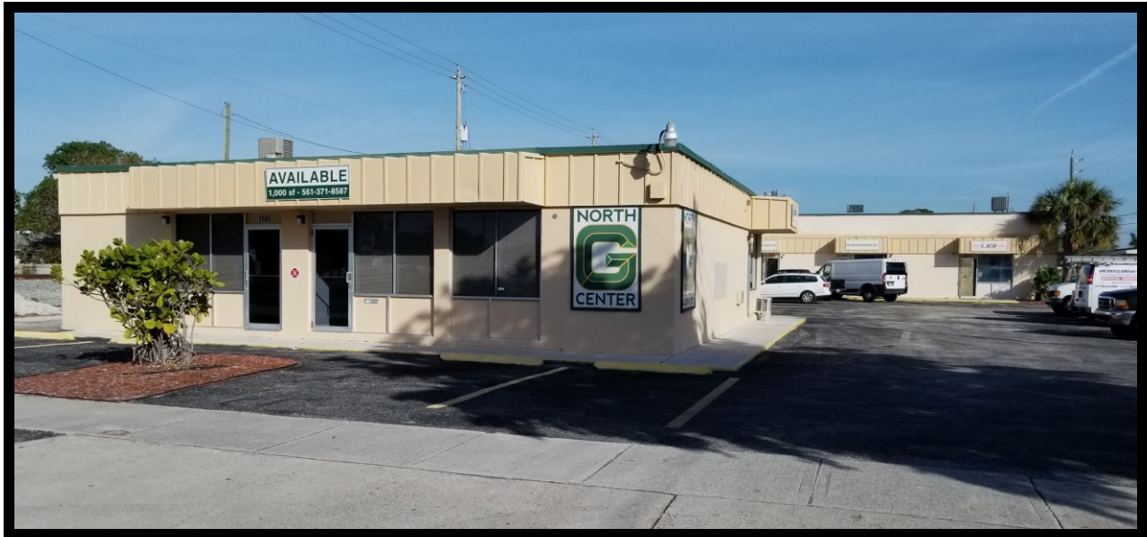
NORTH G CENTER – 1301 – 1307 CENTRAL TERRACE, LAKE WORTH, FLORIDA