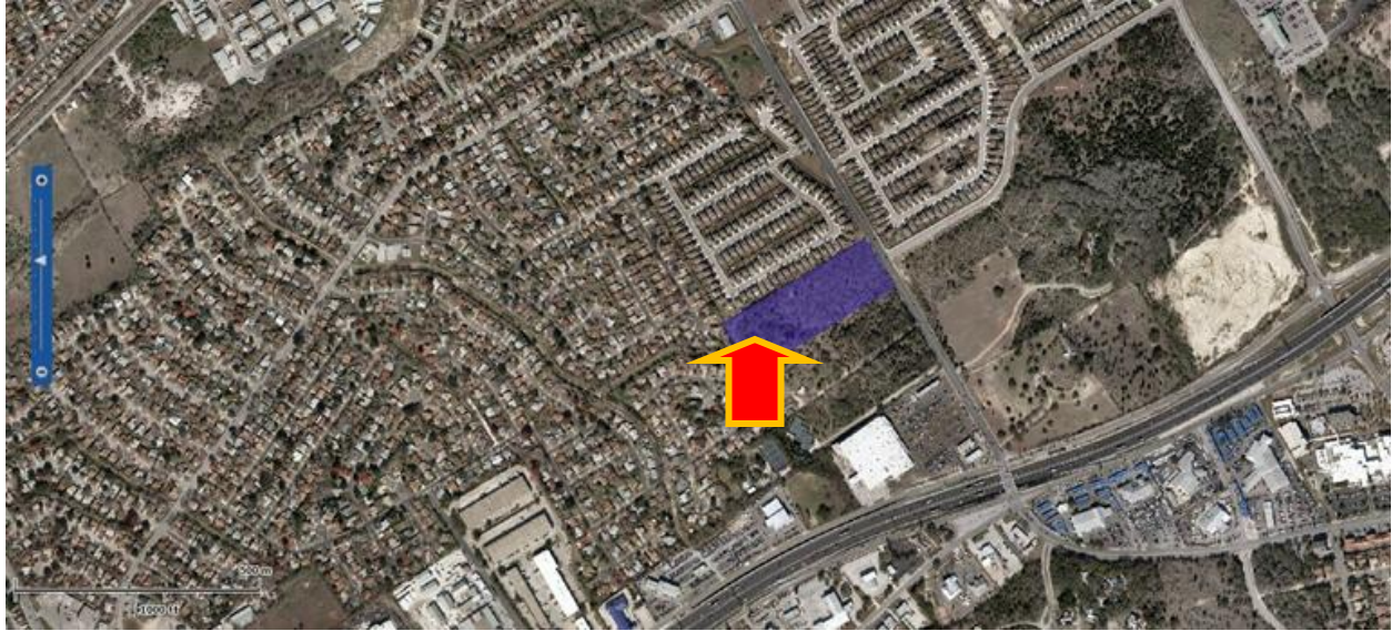
AERIAL PLAT 2