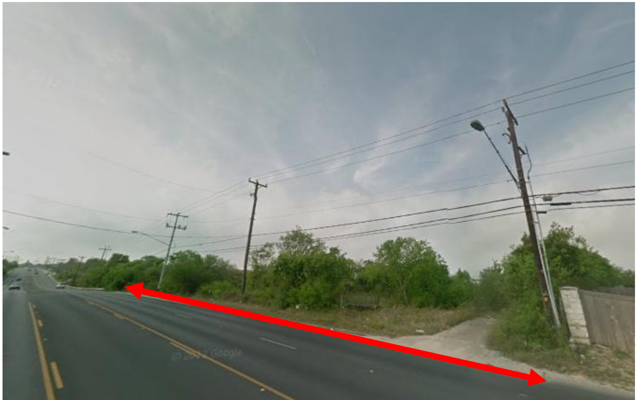
PROPERTY FRONTAGE ON JUDSON

Located at the NE sector of San Antonio, just west of the IH-35 and Judson Road intersection. From Loop 1604/IH-35 intersection take the southbound IH-35 and exit right at Judson Road. The property is located just west of Sam's on left side. Excellent traffic flow, accessibility and strong demographics.