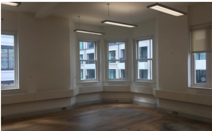
*photo showing the 3rd floor