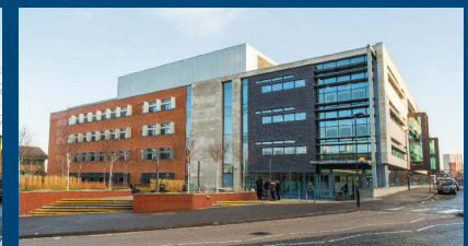
Birmingham City Council