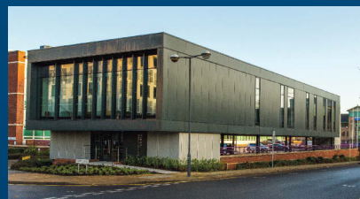
Universities Centre, Innovation Birmingham Campus