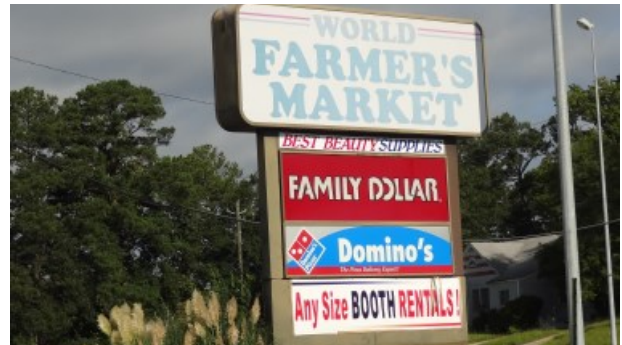
Signage on Mercer Univ. Dr.