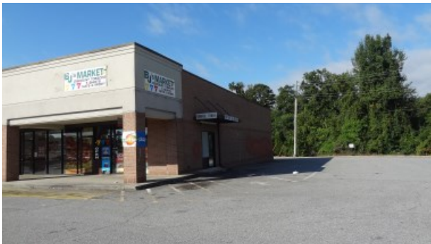
Side of Building