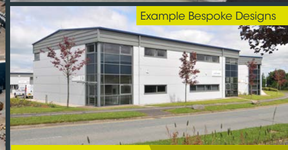
Example Bespoke Designs