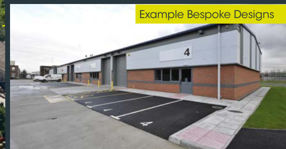
Example Bespoke Designs