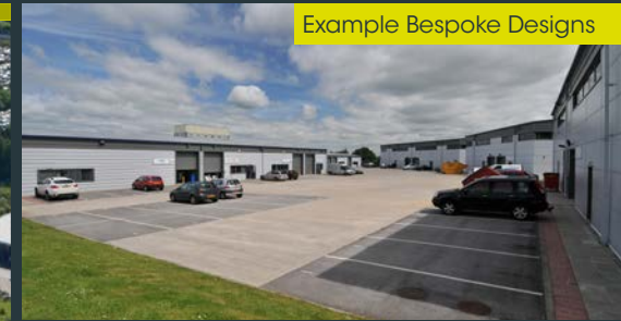
Example Bespoke Designs