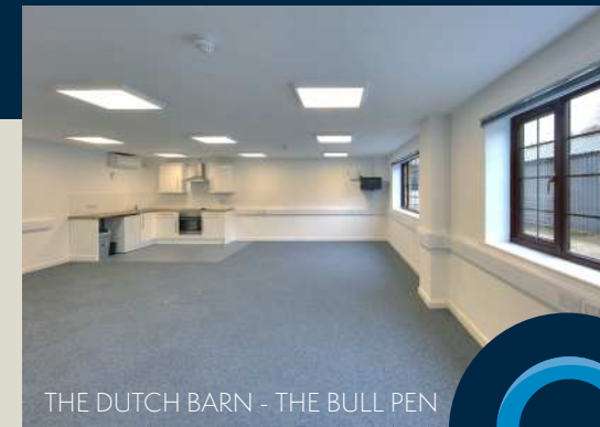
THE DUTCH BARN - THE BULL PEN