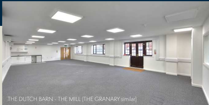
THE DUTCH BARN - THE MILL (THE GRANARY similar)