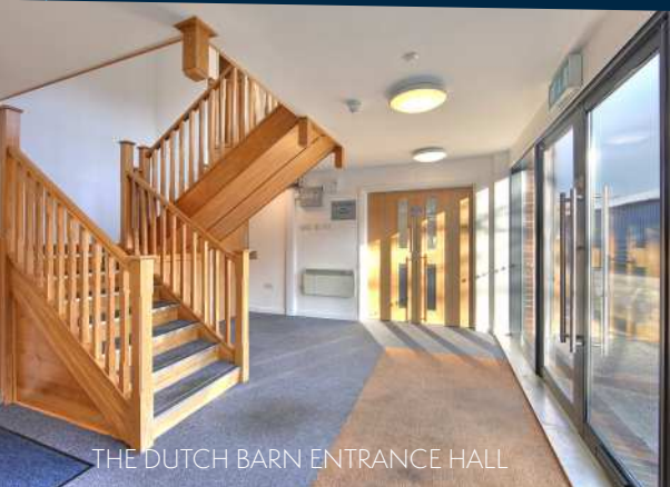
THE DUTCH BARN ENTRANCE HALL