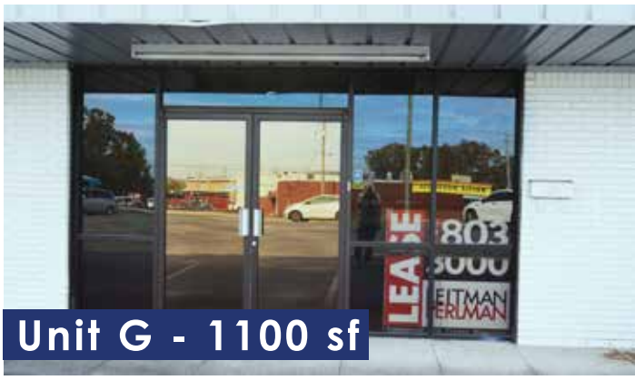
Unit G - 1100 sf