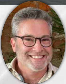
CONTACT MARC PERLMAN