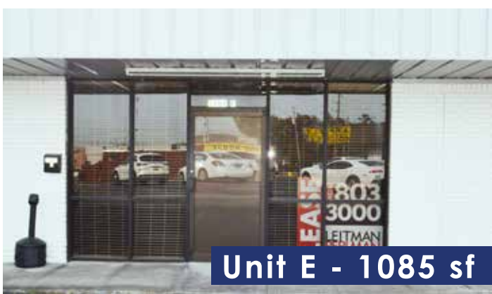
Unit E - 1085 sf