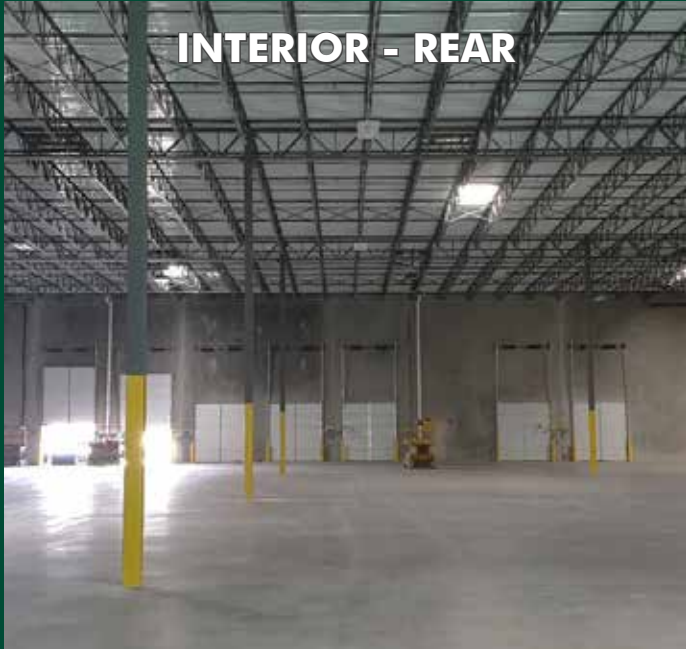
INTERIOR - REAR