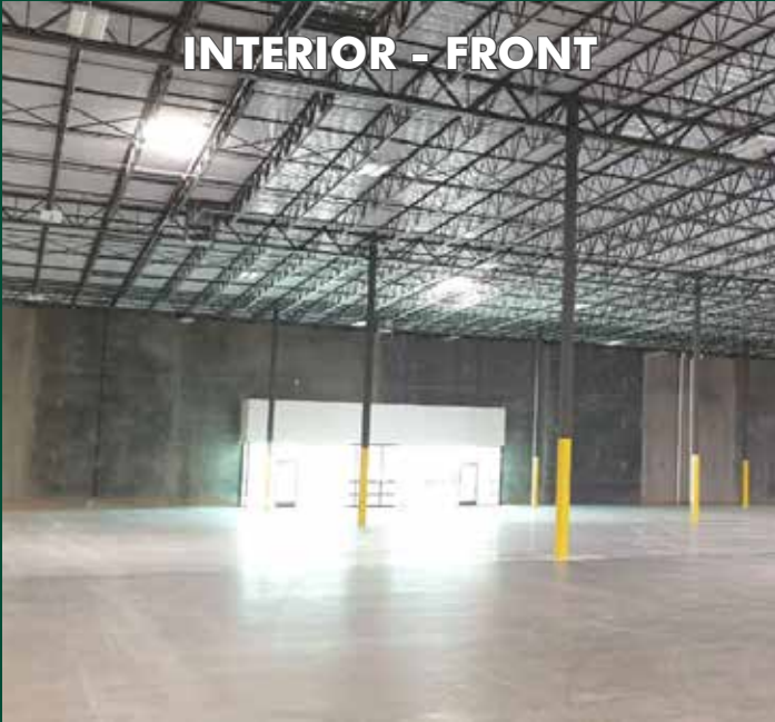
INTERIOR - FRONT