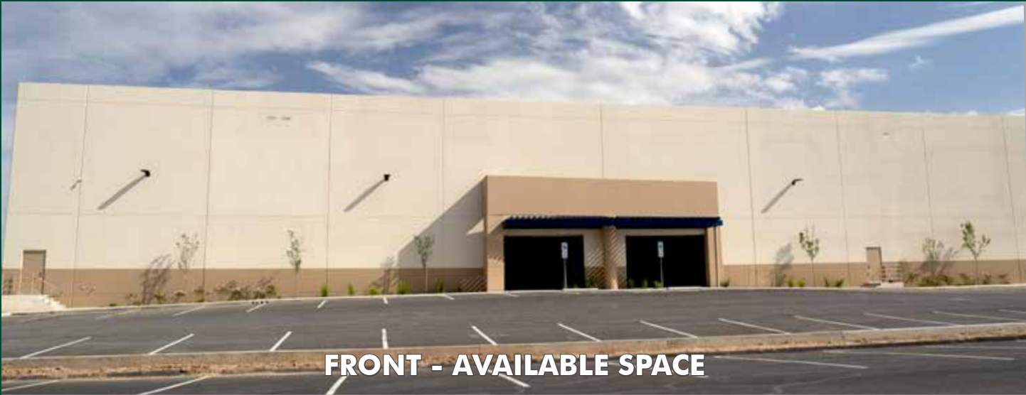
FRONT - AVAILABLE SPACE