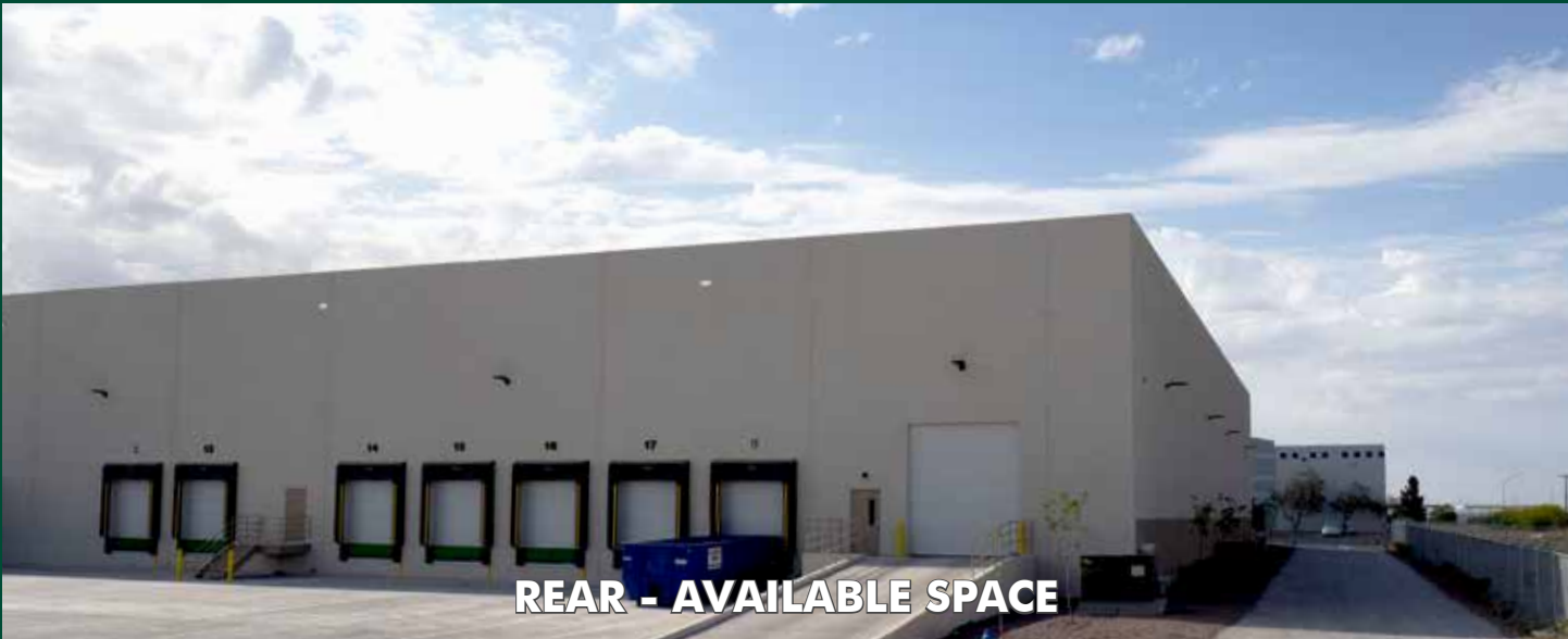
REAR - AVAILABLE SPACE