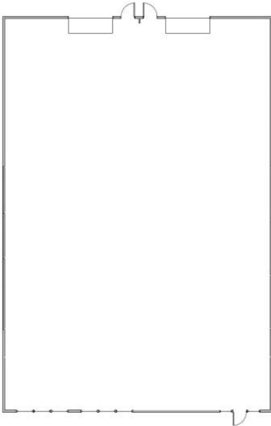
Current As-Is Shell Floor Plan