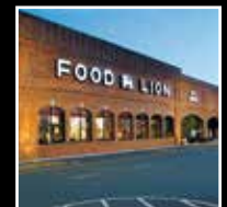
Summerfield Renaissance Summerfield, NC