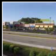
501 Village Myrtle Beach, SC