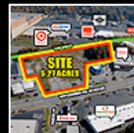
2414 Battleground Greensboro, NC