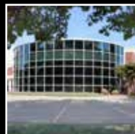
809 Green Valley Rd. Greensboro, NC