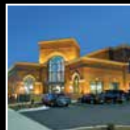
Westover Gallery Greensboro, NC