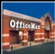
810 Spring Lane Sanford, NC