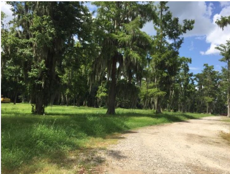
Ready for Expansion! Pads ready, water and/or sewer to additional 50 sites.