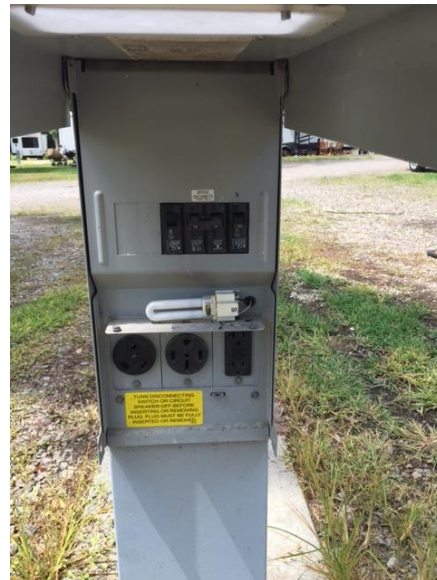
30, 50 amp