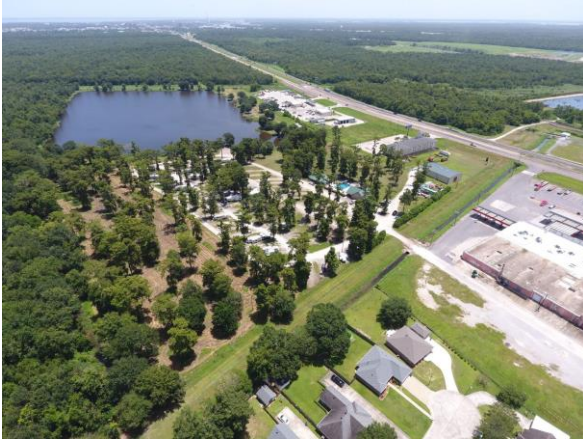
Park to Hwy 90