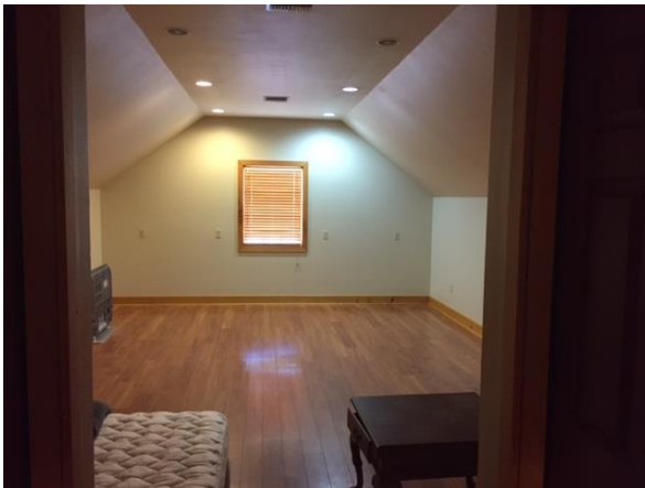
Apartment living area