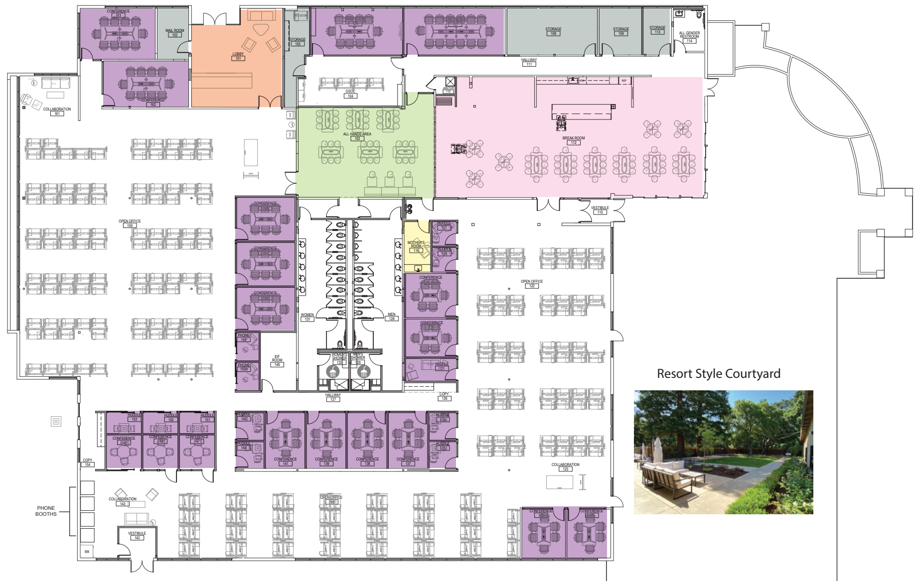
Resort Style Courtyard