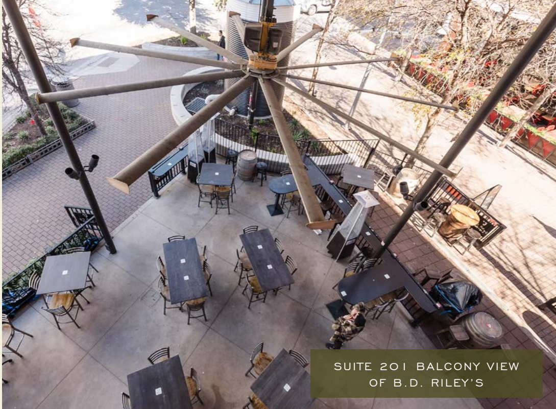
SUITE 201 BALCONY VIEW OF B.D. RILEY'S