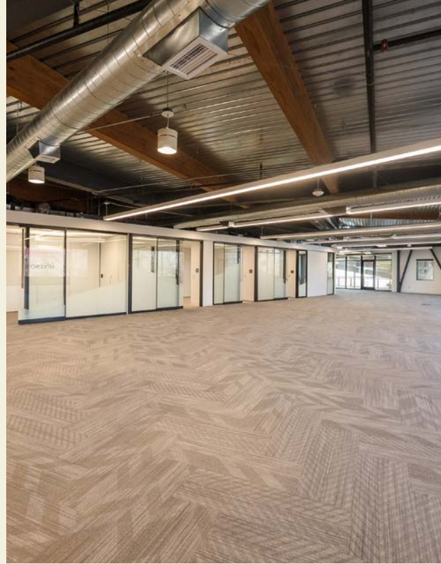
INTERIOR PHOTOS SUITE 201