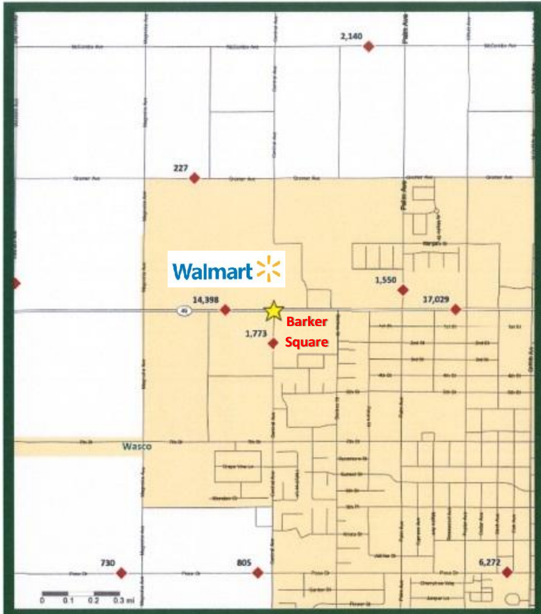
Wasco, CA: Traffic Counts