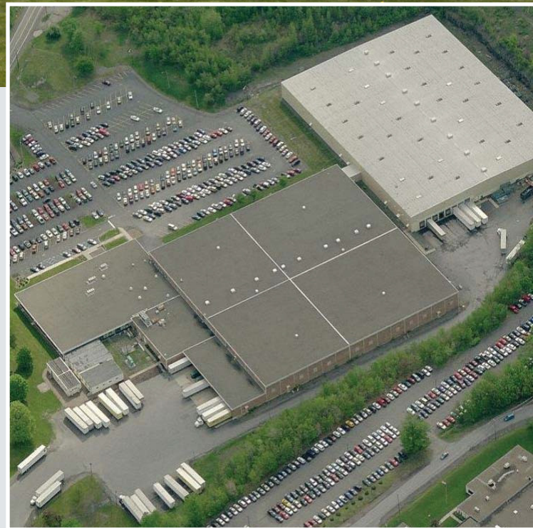
Located in Keystone Industrial Park