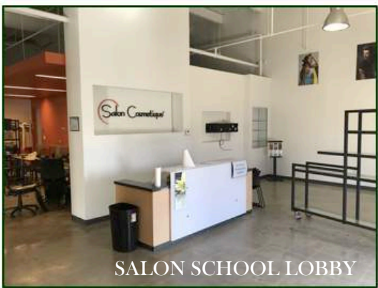
SALON SCHOOL LOBBY