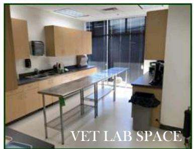
VET LAB SPACE