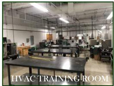
HVAC TRAINING ROOM