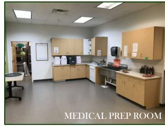
MEDICAL PREP ROOM