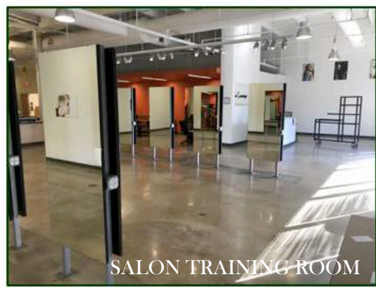
SALON TRAINING ROOM