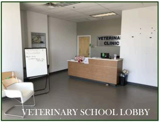
VETERINARY SCHOOL LOBBY