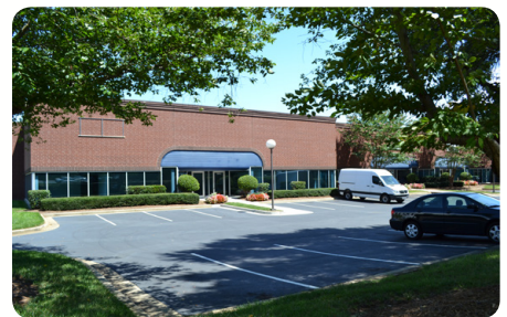
14201 South Lakes Drive