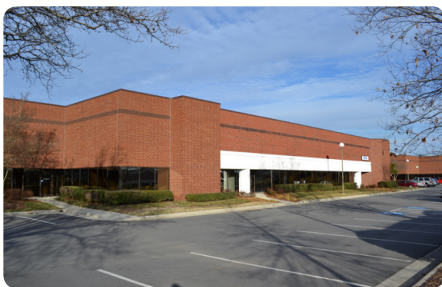
13504 South Point Boulevard