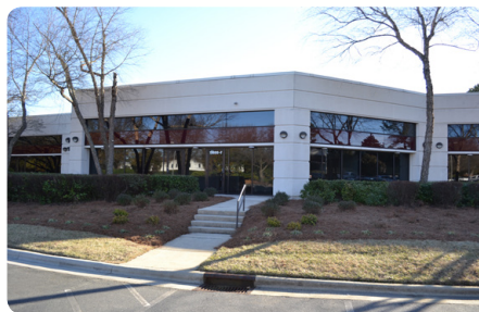
13900 South Lakes Drive