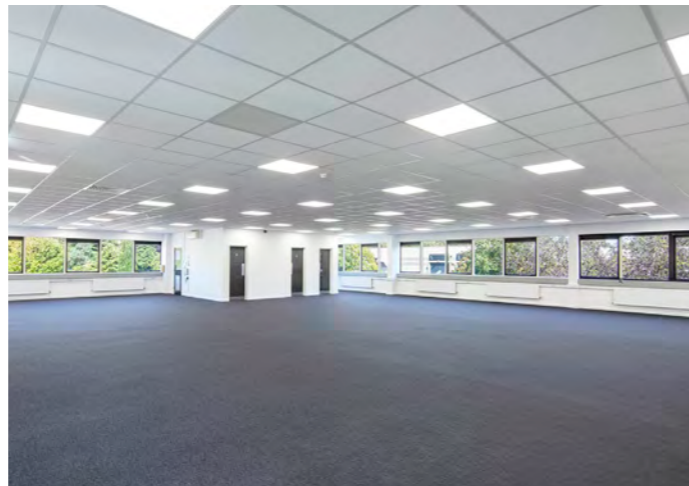
Indicative office refurbishment