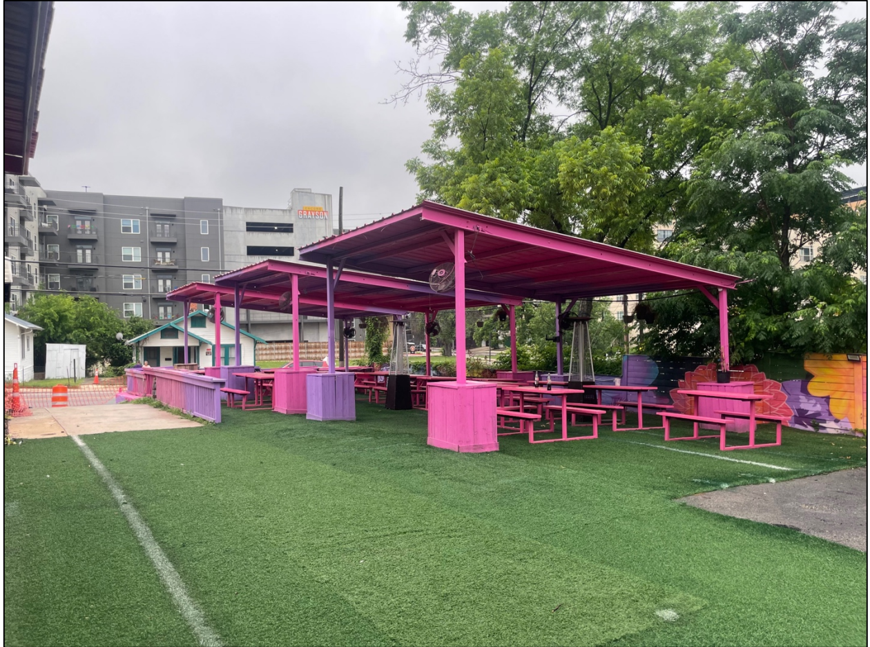
Existing Covered Patio area