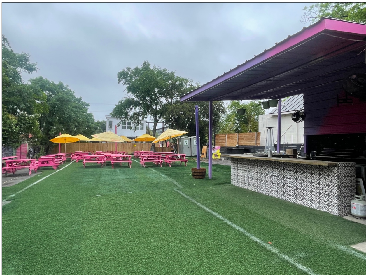
Existing Outdoor bar