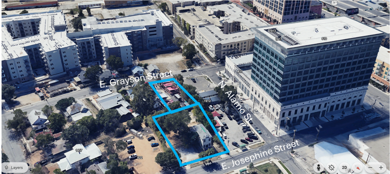
Thousands of apartments within walking distance