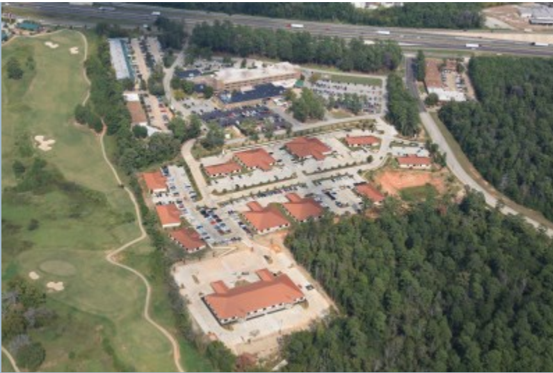
Looking East at Property and Adjacent Huntsville Memorial Hospital Campus