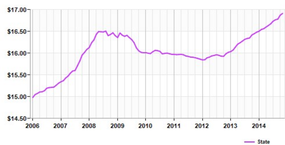
Asking Rent Office for Lease Huntsville, TX ($/SF/Year)