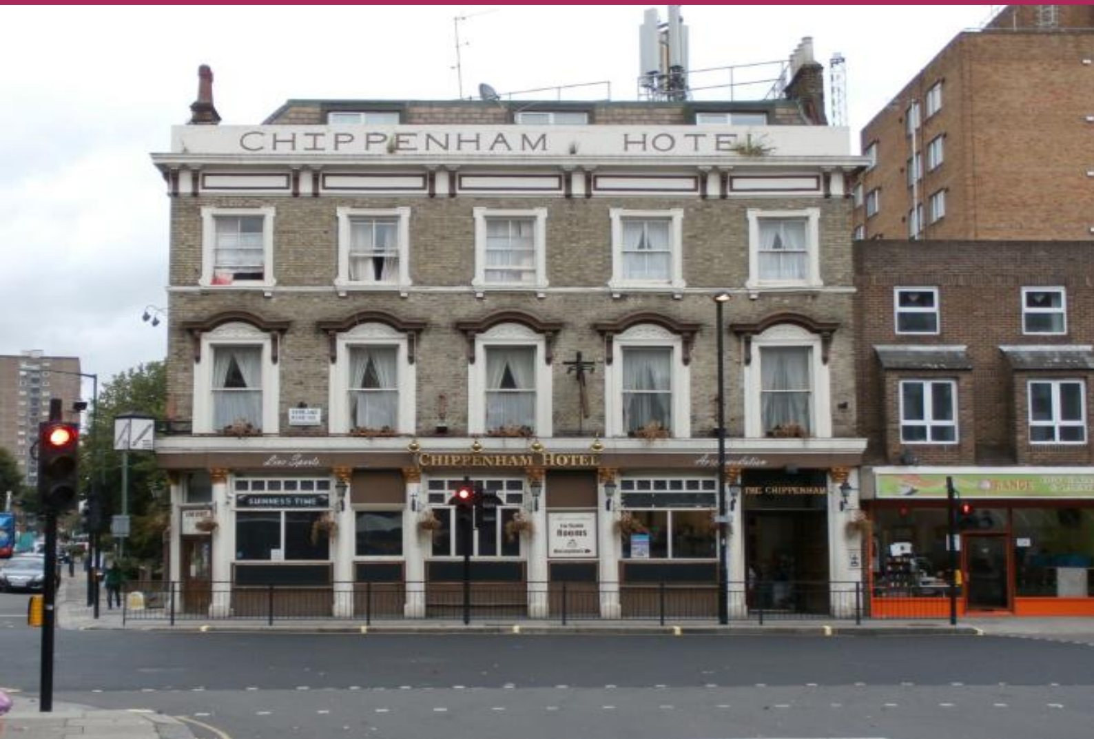
Chippenham Hotel, 207 Shirland Road, Maida Vale, London, W9 2EX