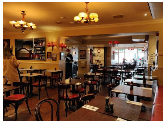
Photograph taken Dec 2018

Misrepresentation Act 1967: Pennycuick Collins Chartered Surveyors (and their joint agents where applicable) for themselves and for the vendors or lessors of this property whose agents they are, give notice that: (1) These particulars do not amount to, nor amount to any part of, an offer or contract. (2) None of the statements contained in these particulars should be relied on as statements or representations of fact, therefore all prospective purchasers or tenants must satisfy themselves as to their accuracy. (3) Neither the vendor nor lessor of this property, nor Pennycuick Collins Chartered Surveyors (or any person in their employment) has any authority to make, give or imply any representation or warranty whatsoever in relation to this property. (4) The reference to any plant, machinery, equipment, services, fixtures or fittings at this property shall not amount to a representation (unless otherwise stated) as to its state or condition or that it is capable of fulfilling its function. Prospective purchasers or tenants should satisfy themselves as to the condition of such items for their requirements.