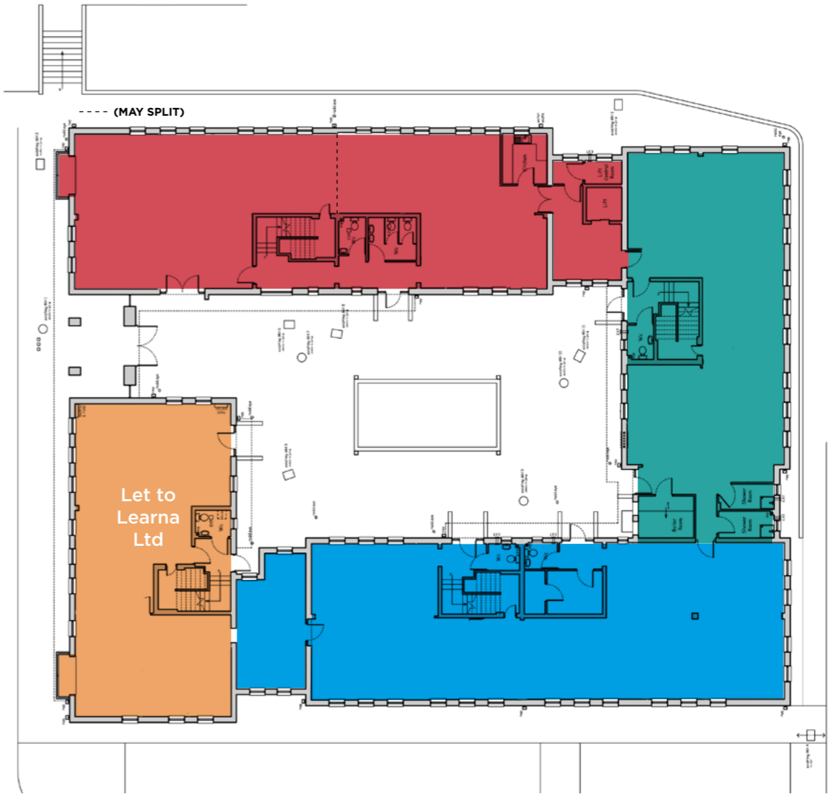
Illustrative plan only