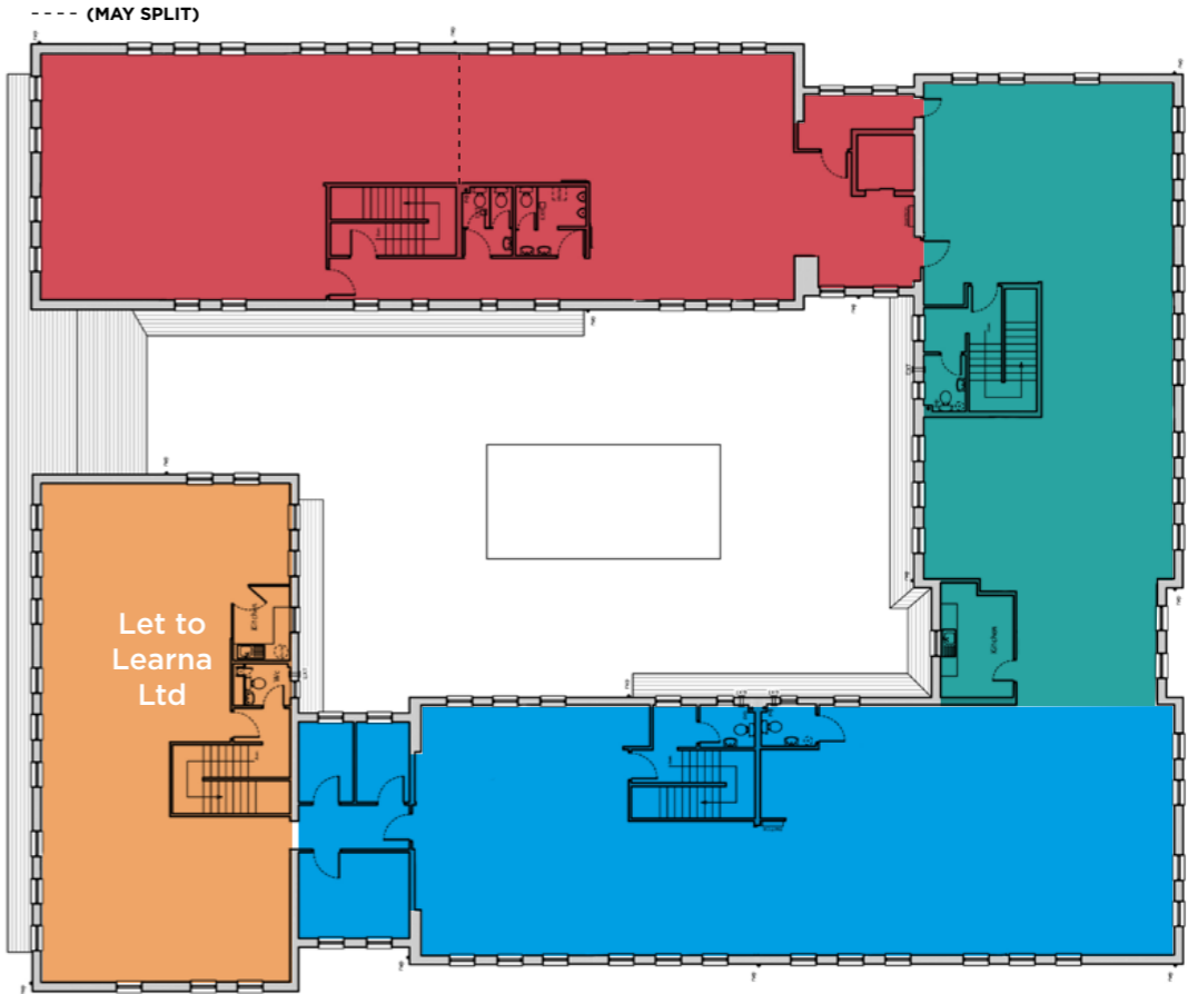
Illustrative plan only