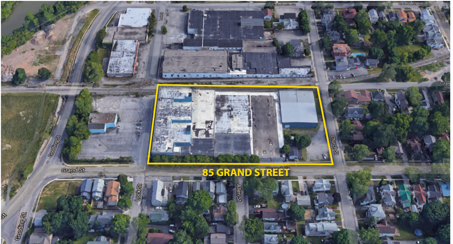
85 GRAND STREET