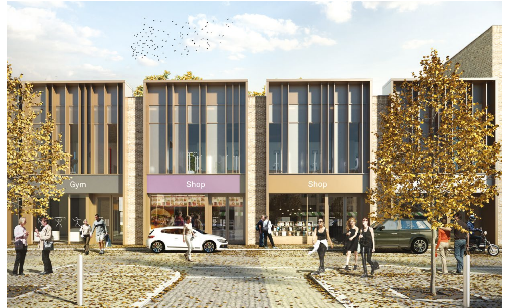
View towards retail units 4 & 5