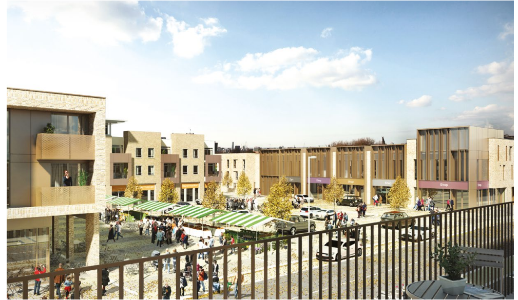
View from Fen Street

Other commercial uses will be considered subject to planning consent and application.