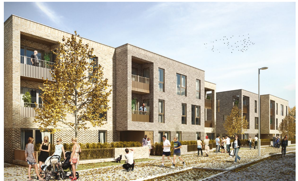
View of surrounding apartments