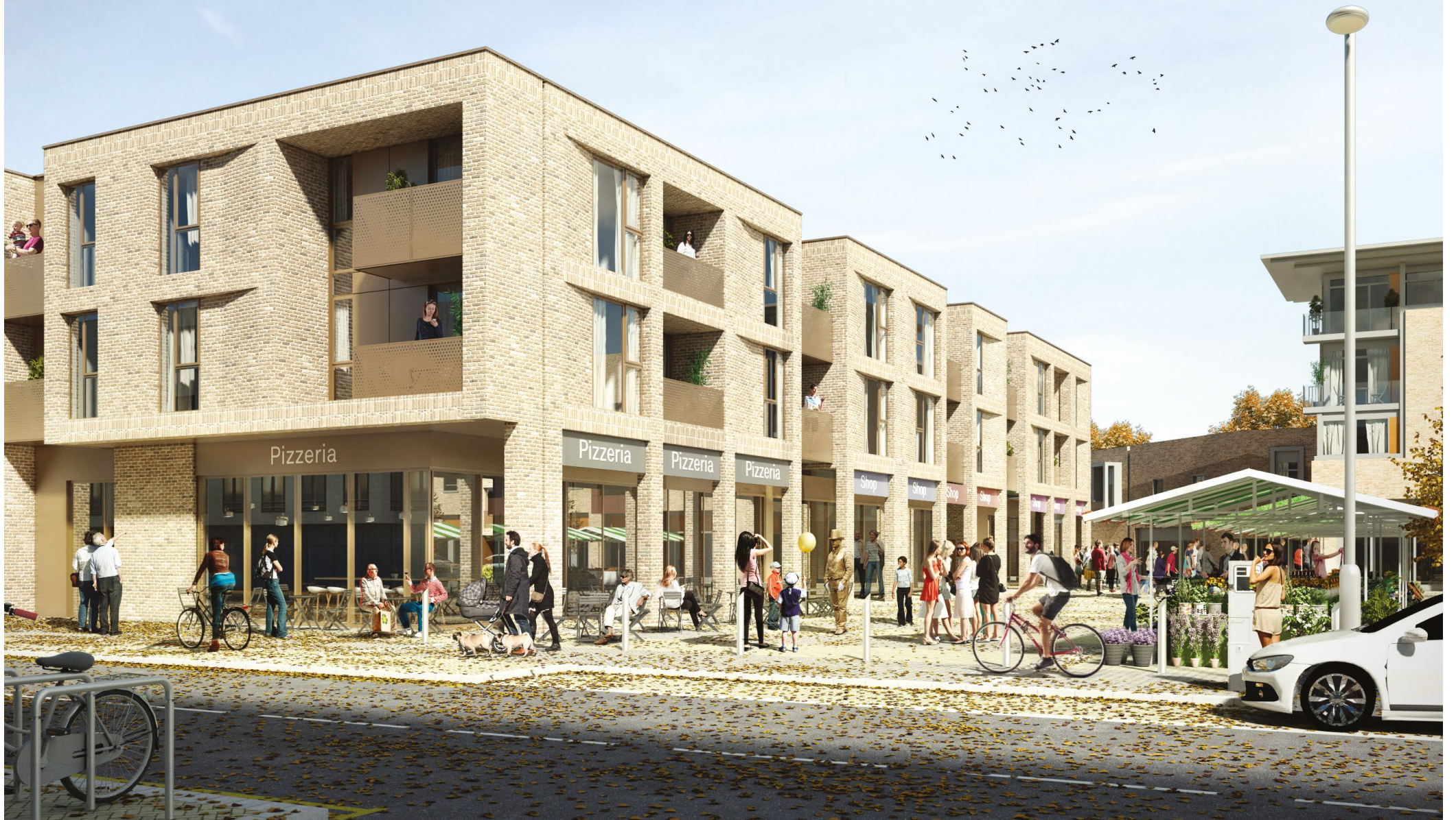
View of units 9-10 and 11