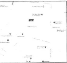
VICINITY MAP 1" = 800'