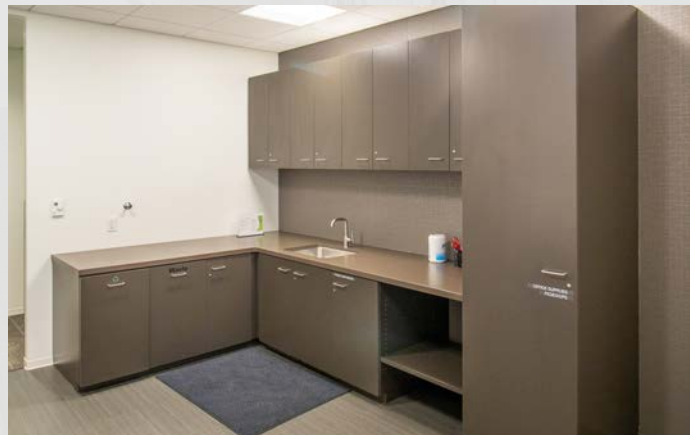
SUITE 1180, 4,147 RSF