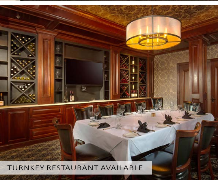
TURNKEY RESTAURANT AVAILABLE