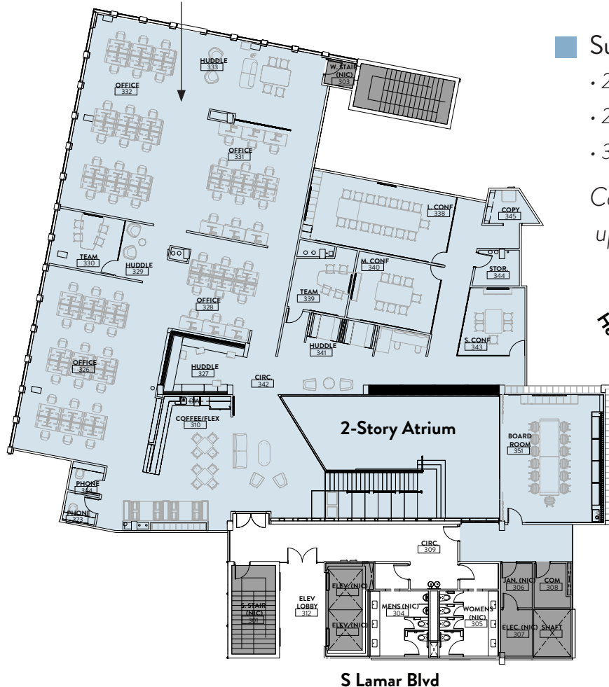
Suite A, Third Floor ±9,876 SF