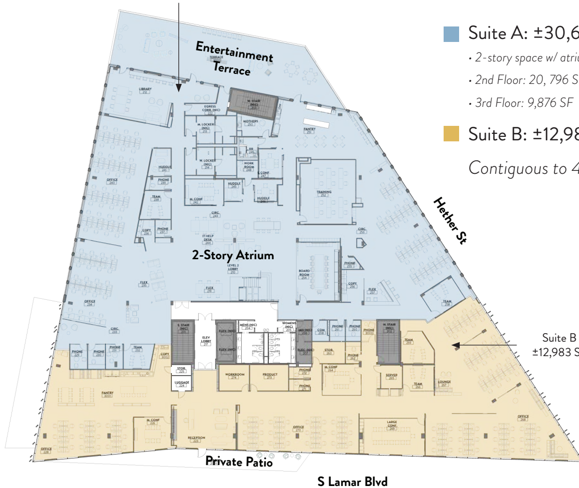
Suite A, Second Floor ±20,796 SF