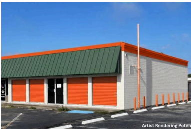
Artist Rendering Potential