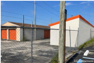
Artist Rendering Potential