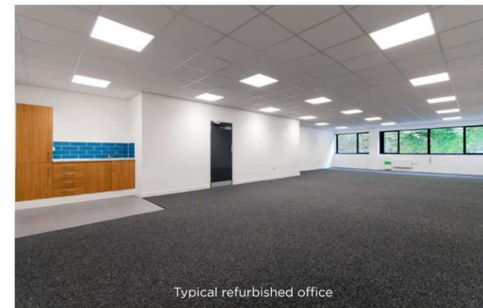
Typical refurbished office