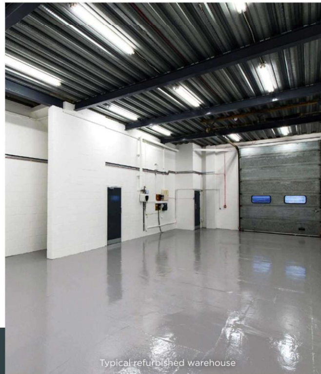
Typical refurbished warehouse