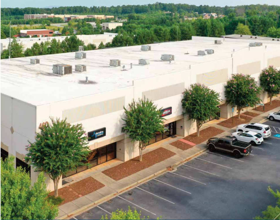
460 Brogdon Road | Suwanee, Georgia 30024