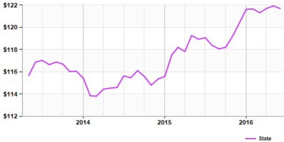
Asking Prices Retail for Sale Swansboro, NC ($/SF)