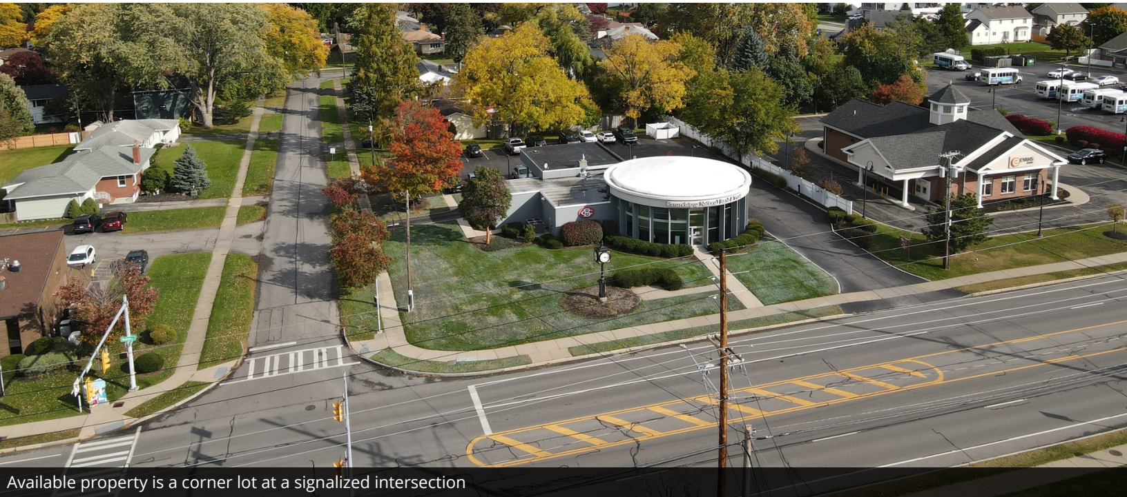
Available property is a corner lot at a signalized intersection