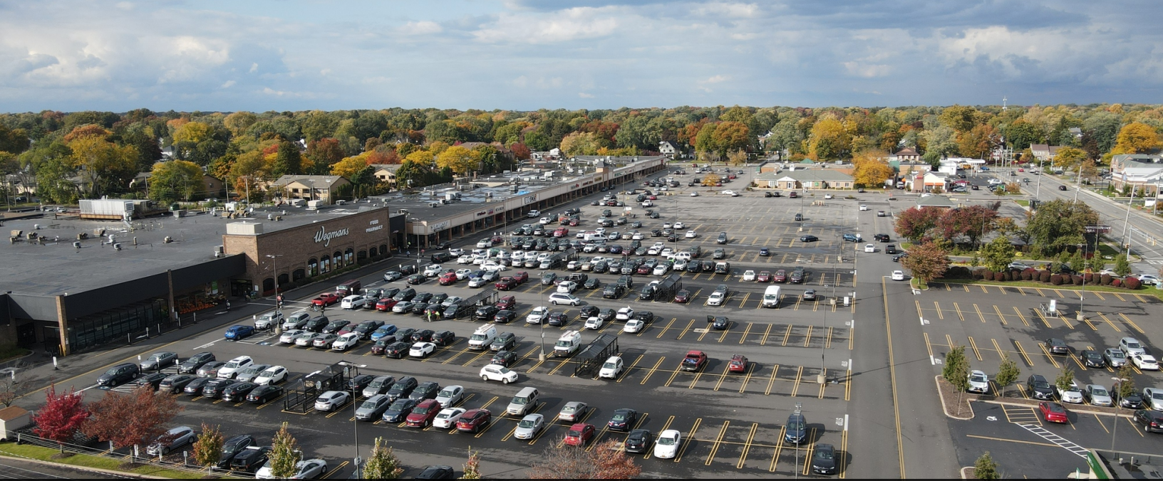
Wegmans-anchored shopping center across the street has 2.5mm visitors a year