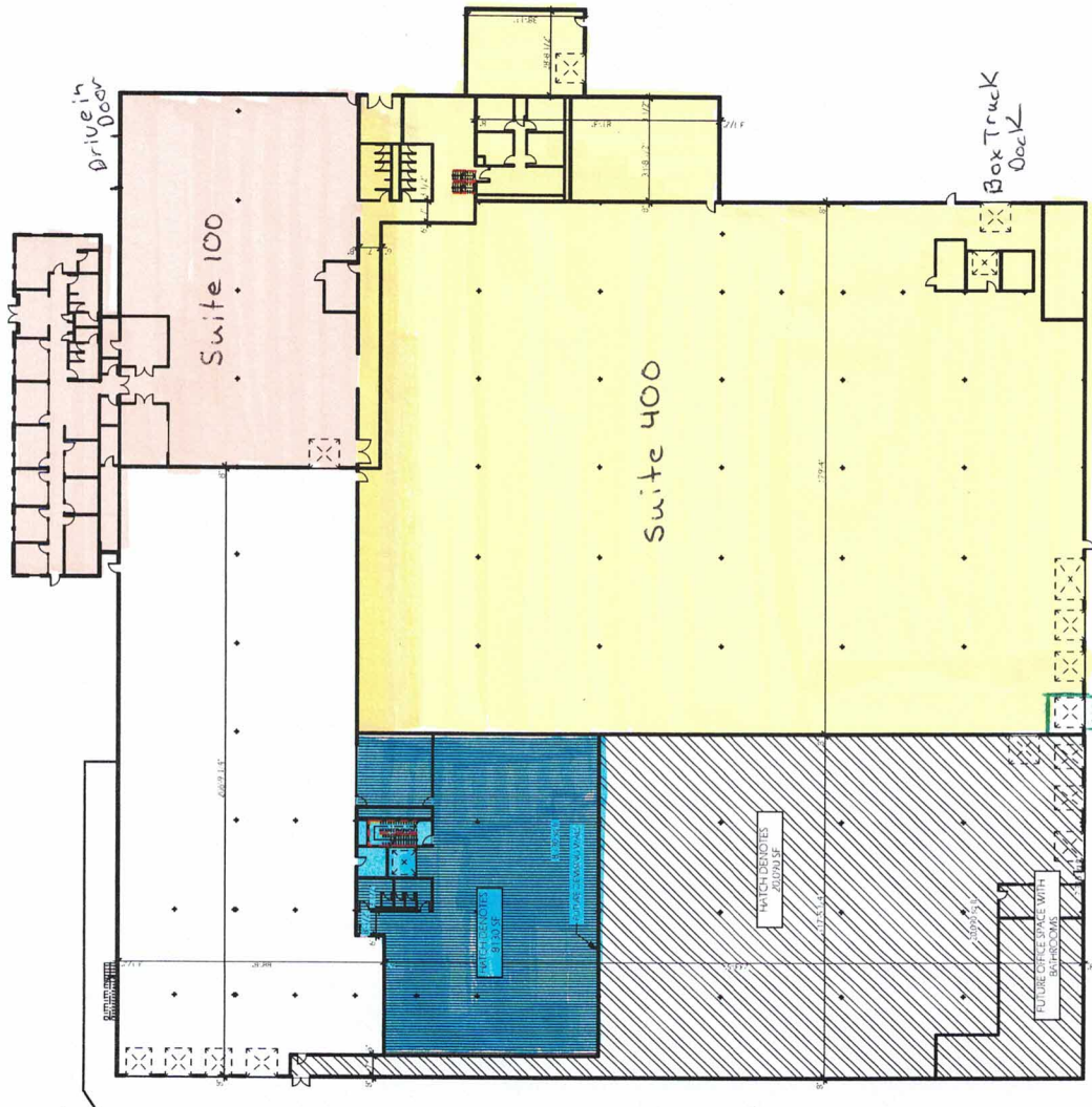
1 OVERALL 1st FLOOR SCALE: 1/8" = 1'-0"